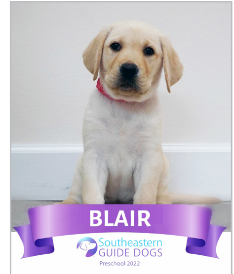
In honor of World Animal Day, the Foundation sponsored a therapy dog through Southeastern Guide Dogs and fondly named her "Blair", in honor of our commitment to serving others and our beginnings in Blairsville, GA.